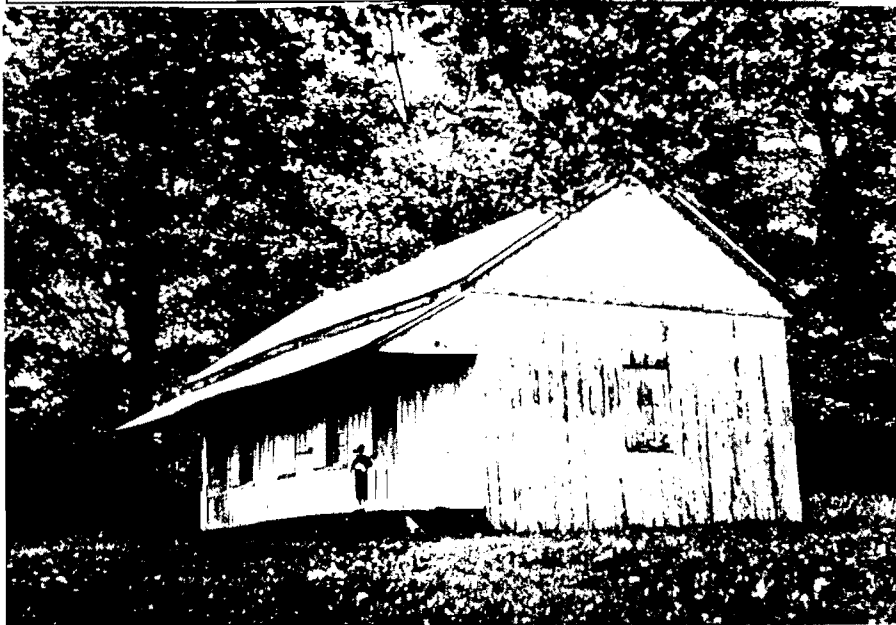
The Uxbridge Friends' Meeting House

A good example of board and batten construction, this Meeting House was erected in 1820 to replace an earlier log structure. The building stands in the midst of the original Uxbridge Quaker Settlement, a venture begun in 1805 by some twelve families from Pennsylvania. The unaffected design of the building reflects the Quaker philosophy of plainness and restraint. The Uxbridge Settlement prospered until the mid-nineteenth century when the Quaker population declined. Closed in 1925, the Meeting House has since been re-opened for annual interdenominational religious services. In the adjoining cemetery on "Quaker Hill" are buried some of the area's earliest settlers, including Joseph Gould, a noted local industrialist and parliamentarian.