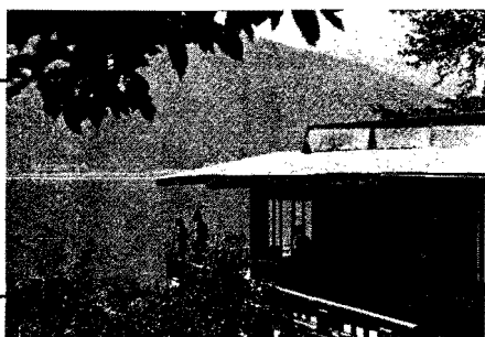
Argenta, B.C., Meeting House—1968