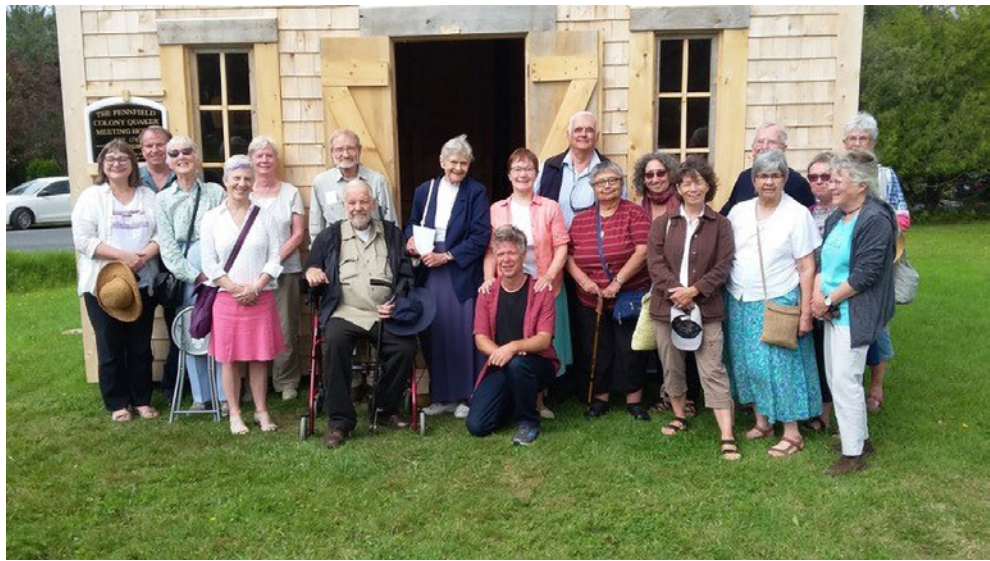
ABOVE: Participants at the celebration and dedication of the Beaver Harbour, New Brunswick replica Quaker meetinghouse pose in front of the building.