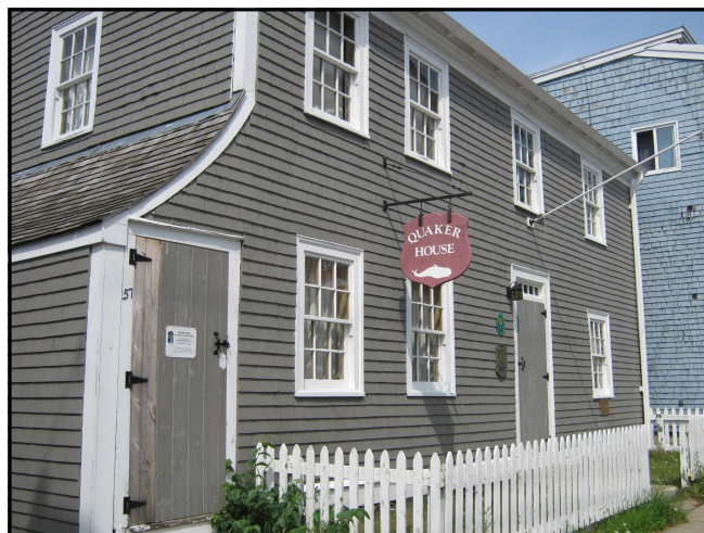
The Quaker Whaling House, Dartmouth, N.S.