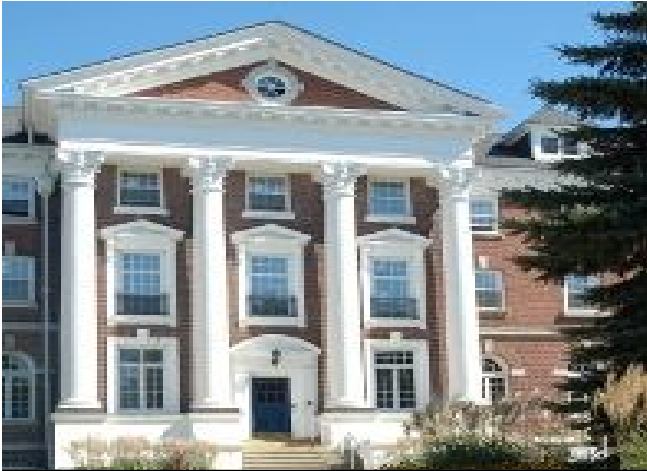
Pickering College, Newmarket, Ontario

The 19 th Biennial Conference of Quaker Historians and Archivists is coming to Pickering College , Newmarket Ontario from June 22 to 24, 2012!