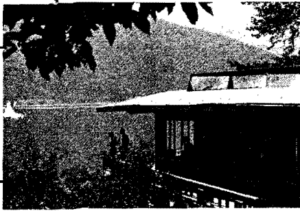
Argenta, B.C., Meeting House—1968